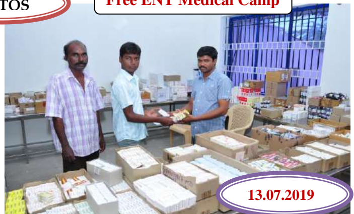
Free ENT Medical Camp